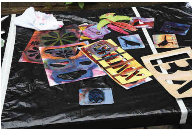
Artists of all ages and skill levels utilized various stencils for the mural project.