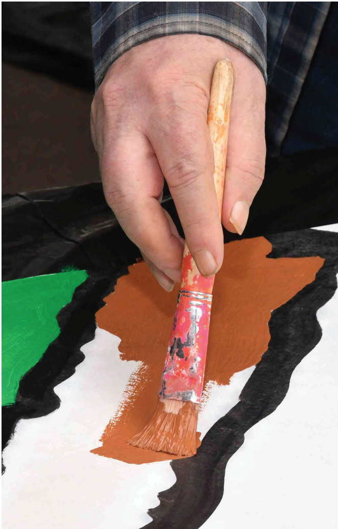
Phil Engler carefully painted the tree mural's bark.